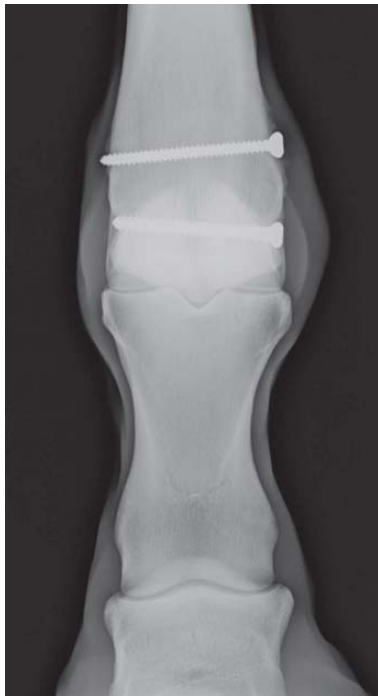
This fracture was repaired surgically last May and this horse is now sound and back in training.

It is really important that these limbs are immobilised completely prior to travelling to the clinic with a bandage or cast by a vet and special care is taken when knocking them out and recovering them.