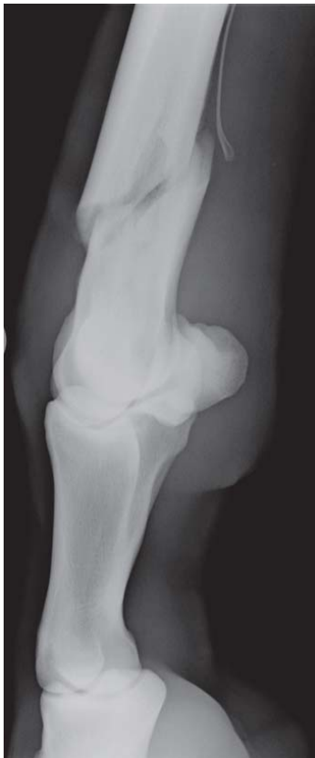
A catastrophic fracture of the cannon bone which caused this particular racehorse to be immediately euthanased. The horse was presented as a cellulitis with severe swelling and lameness.

Fractures occur commonly in horses for many reasons; they are large and heavy yet have relatively spindly limbs but we expect them to perform at speed; a galloping race horse exerts 7 tonnes of weight through a single limb.