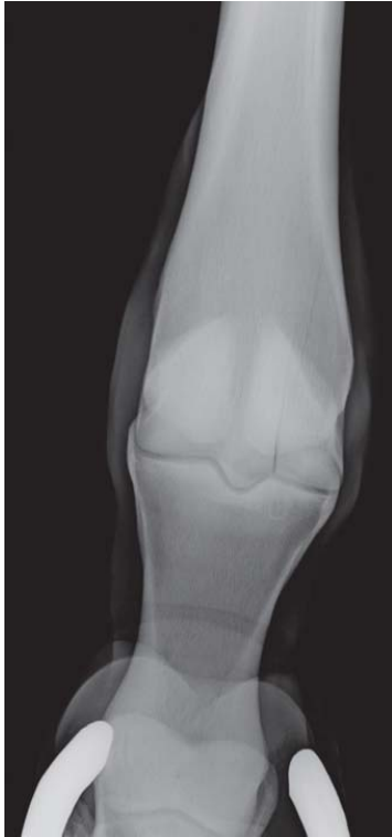
There is a fine fracture line running across the condyle (knuckle) of the fetlock. The horse was non-weight bearing lame even when sedated so the limb had to be x-rayed at an angle.

FRACTURED PASTERN or FETLOCK These injuries again are often related to the 'stress' of repeated training. Fractures of the long or short pastern bones and of the sesamoids (back of the fetlock) or condyles' (knuckles at the bottom) of the fetlock can be fixed now surgically.