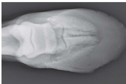
This fracture of the pedal bone was on a hind leg and healed without surgery, unusually, since it involved a joint

...these have a worse prognosis. By long bone we mean for example a fractured tibia or radius. These fractures are difficult to treat and mostly require the animal to be immediately destroyed. For humane reasons it would be very cruel to transport an animal in this condition, as nothing you could do would immobilise the limb for the journey. Having said that, there are cases of expensive breeding stallions having the lower limb amputated and a prosthesis fitted going on to work for another 2 seasons. These cases though, are unusual, and one has to wonder if it is fair to the horse.